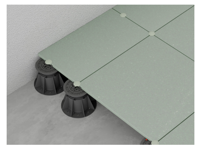
Stack Bond Layout