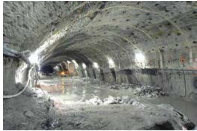
VersiDrain 8 Mesh provides efficient drainage of tunnels and internal basement walls

VersiDrain® 8 Mesh is manufactured and tested according to DIN 18 195, DIN 4095, DIN 4102, DIN 53 576 and BS 8102.