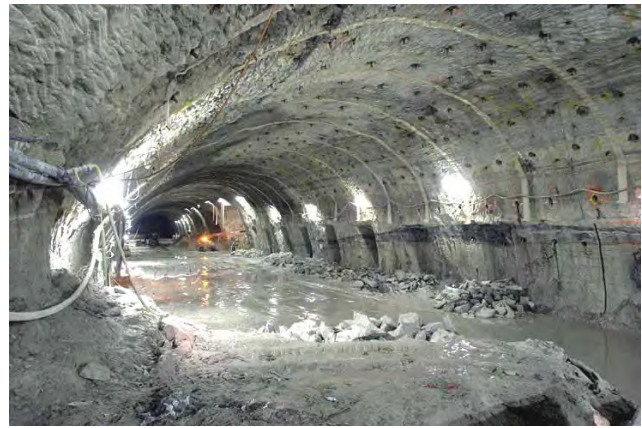
VersiDrain 8 Mesh provides efficient drainage of tunnels and internal basement walls

VersiDrain® 8 Mesh is manufactured and tested according to DIN 18 195, DIN 4095, DIN 4102, DIN 53 576 and BS 8102.