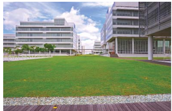
Fire Engine Access

TurfPave® HD is suitable for use as a permeable surface in stormwater management systems as it allows rain water to percolate through the in-fill and infiltrate into the base course below. This process serves to filter pollutants from stormwater at source and prevents water logging. Concrete or asphalt surfaces are impervious surfaces and do not allow infiltration thereby contributing to the Urban Heat Island Effect (UHIE).